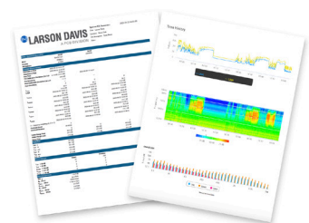
G4 LD Utility Measurement Report