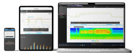
Apps for Phone, Tablet, and Windows®