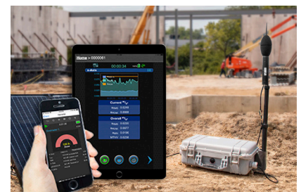
LD Atlas™ Mobile App