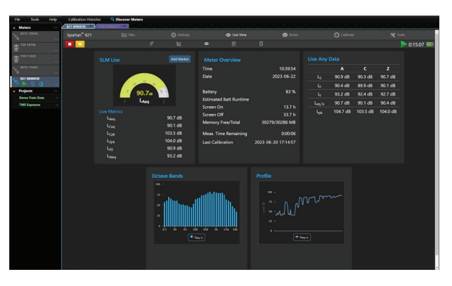
Live Sound Measurement View