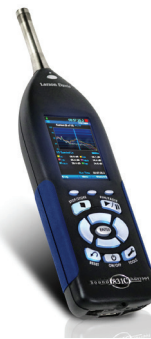
SoundAdvisor Model 831C