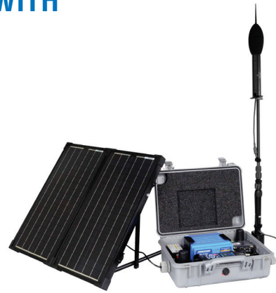
Portable Noise Monitor Model NMS044