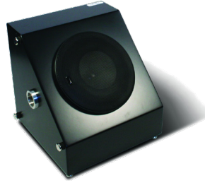
BAS003 Directional Source