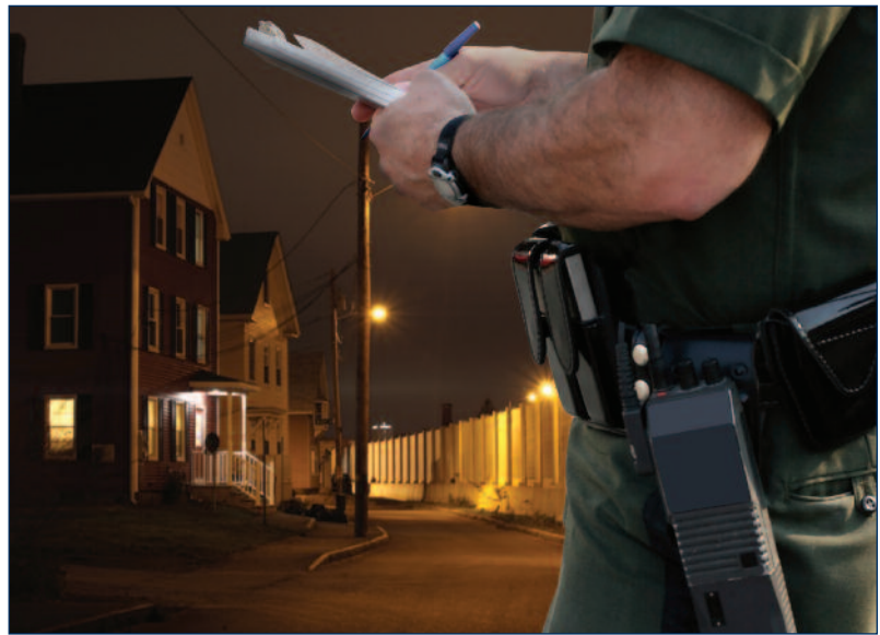
Handle noise complaints easily with N/Forcer Noise Meter