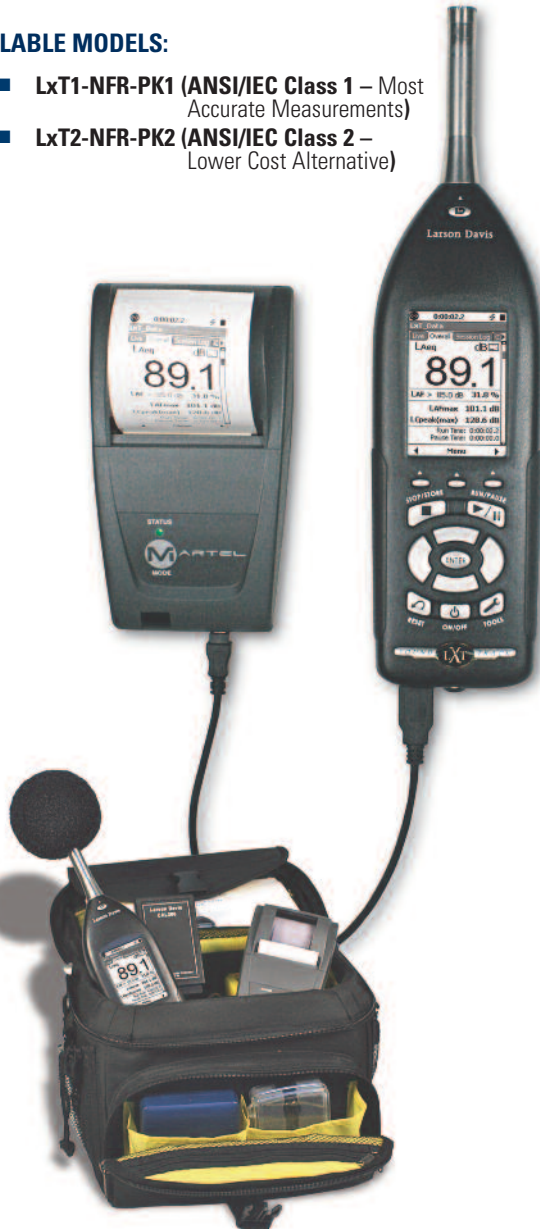
N/Forcer Road Kit