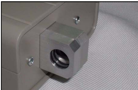
FIGURE 2-2 Aluminum Block with Microphone Ports

The microphone ports are on two opposite faces of an aluminum block mounted on one end of the CAL291, as shown in FIGURE 2-2.