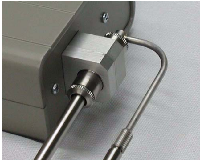
FIGURE 3-1 Microphones In Place Inside Microphone Ports of CAL291