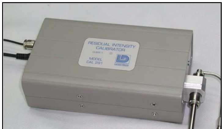
FIGURE 2-1 CAL291, General View

The CAL291 has a flat shape factor for optimal use on a table or desktop. In use, the sound intensity probe of the intensity measurement system to be evaluated is laid flat on the table with the two microphones inserted into the microphone ports of the CAL291 as shown in FIGURE 2-1.