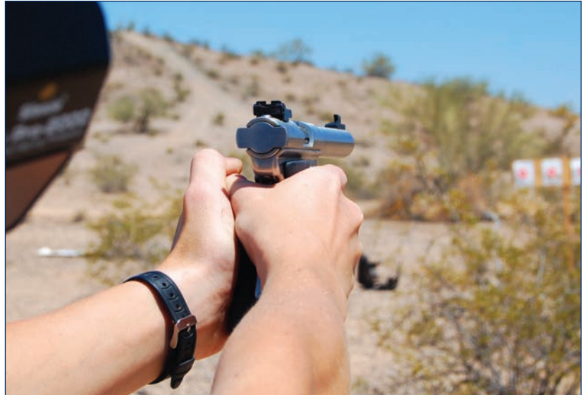
Firearms generate high dB Levels (100 – 165 dB).

Many firearm examiners are tasked with determining whether installation of a suppressor on a firearm results in a “perceptible” reduction of the sound pressure level of a gun. The Larson Davis SoundTrack LxT® provides this functionality utilizing an easy-to-use handheld platform.